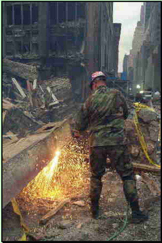
Broco torches were used for the World Trade Center rescue efforts.